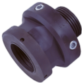
Hydraulic Access Fitting Adaptor

Hydraulic Access Fitting Adaptors are available for conversion of mechanical access fittings to hydraulic system. Observe that this conversion can be done on pressurized pipes. Please contact Emerson/Roxar for more details.