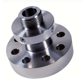
Flanged Hydraulic Access Fitting

The Hydraulic Access Fitting has an ACME threaded outlet to mate with the service valve of the hydraulic retrieval tool system. The Hydraulic Access Fitting has no internal threads, thereby eliminating the danger of a seized plug. Four locking pins hold the internal plug in position for the 6,000 psi/420 bar hydraulic fitting, while six locking pins hold the plug in position for the 10,000 psi/690 bar hydraulic fitting. A heavy duty cover holds the plug in position during permanent operation. The locking pins hold the plug in position when cover is removed, until the plug is controlled by the pressure in the hydraulic retrieval tool.