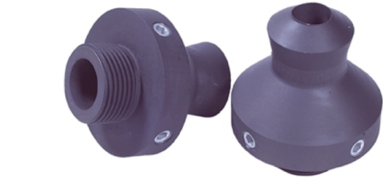
Flareweld hydraulic access fitting

The Hydraulic Access Fitting is available in flareweld and flanged versions as standard. Other versions (e.g. HUB fittings) are available upon request. Hydraulic Access Fittings are manufactured in ASTM A105, ASTM A350 GR. LF2 and Duplex steel as standard materials (other materials available on request). Hydraulic Access Fittings meet NACE MR0175 (sour service) requirements. Norsok specification upon request.