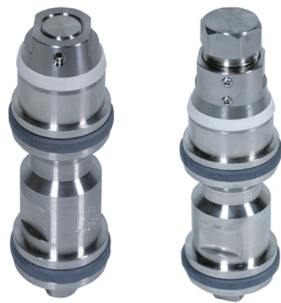
Hydraulic solid and hollow plugs

Hydraulic Access Fitting Adaptors are available for conversion of mechanical access fittings to hydraulic system. Observe that this conversion can be done on pressurized pipes. Please contact Emerson/Roxar for more details.